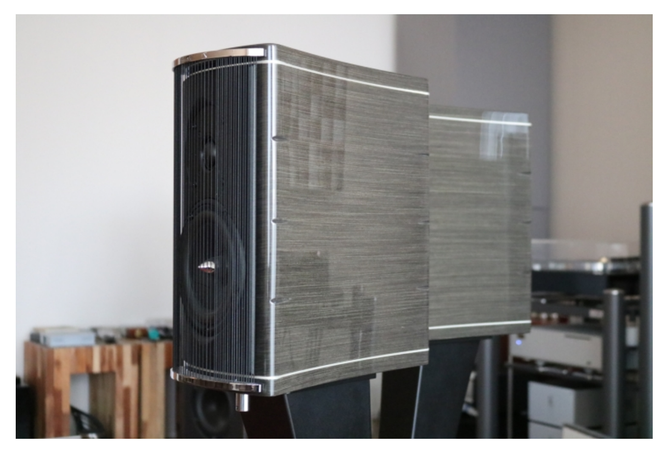
Review samples provided by Durob Audio