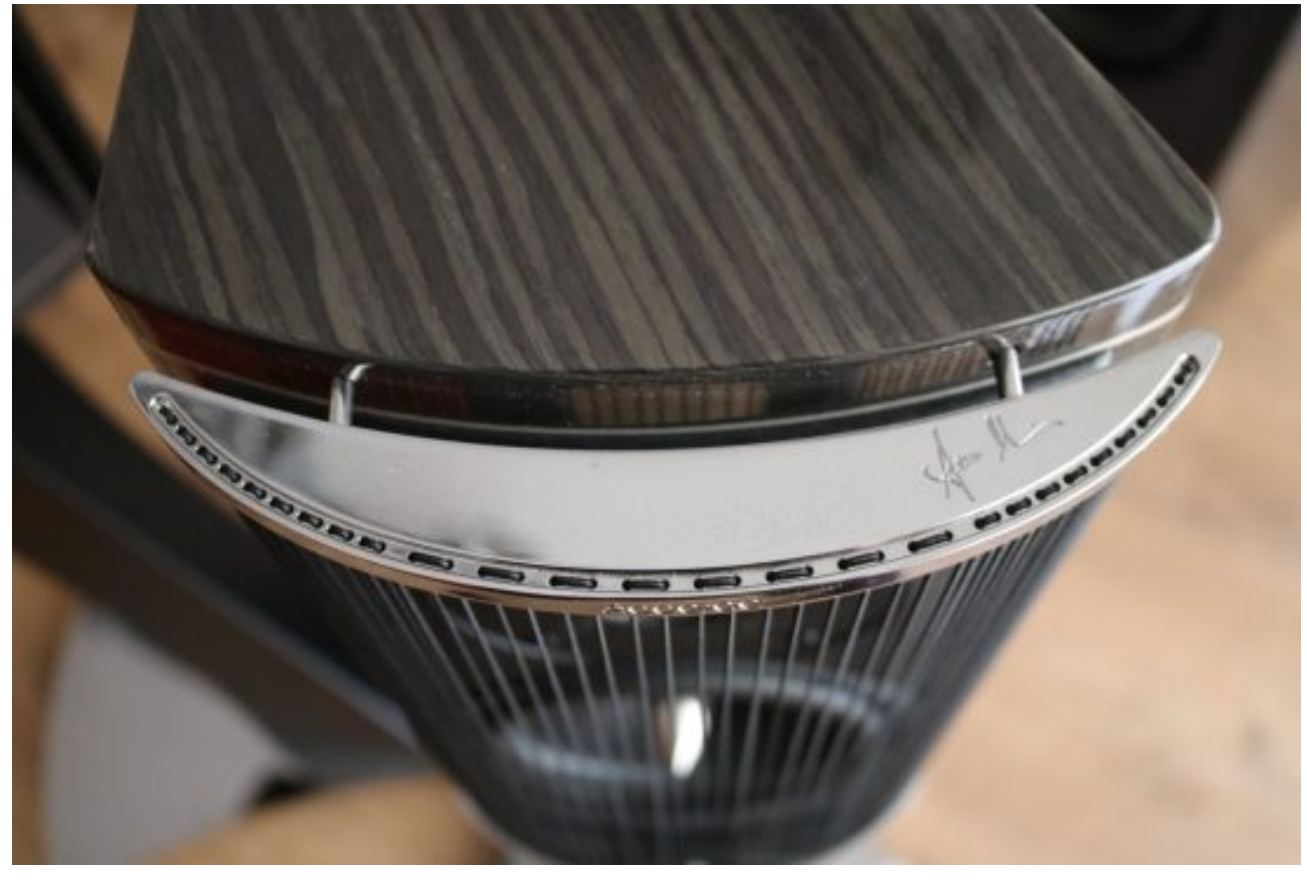
Above: the grill can easily be removed by gently pulling off the top and bottom parts.

When switching back to the Wilsons the main difference is that they are even more neutral and especially more transparent. Naturally, the Wilsons have a much bigger enclosure and double, larger woofers but since I have them set up so that the room contributes much less to their sound via room modes, they sound much smaller than they are, in a good way. And this also brings them closer to the Accordo's, especially when playing acoustic or vocal music. Of course, the Wilsons are easily recognisable when playing I keep coming back to the fact that the curvaceous Accordo's sound incredibly natural. I had already noticed this during my earlier concentrated listening but this aspect further sank in when listening from the next room behind the computer. They won't trick one into thinking that a big PA system is in the next room, but with acoustic music, they do sound as if the singers might actually be right there.