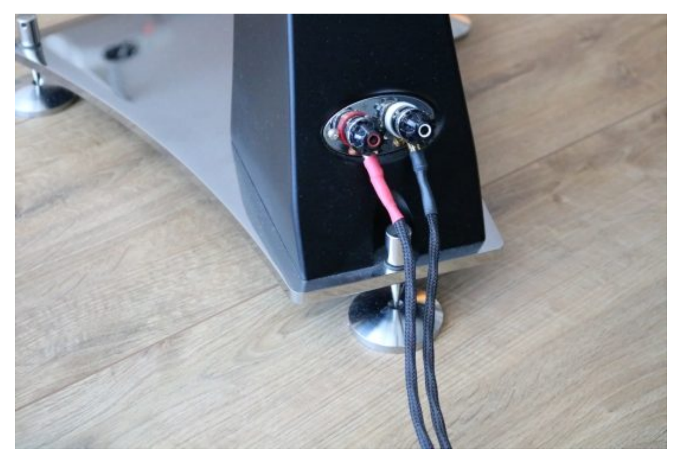
Above: high quality, latest generation, WBT connectors.